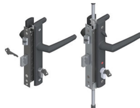
Exclusive Killara furniture with 4 point locking and snib release