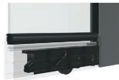
Alspeck's high performance, commercial door roller used in the Carinya residential sliding door for smooth operation.