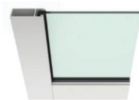
58mm wide rails and stile.

The entire Carinya Collection has been fully tested to meet or exceed Australian Standards AS2047, AS1170, AS1191 and AS3959.