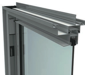
Easy take out clips on side jamba for removal of sash.