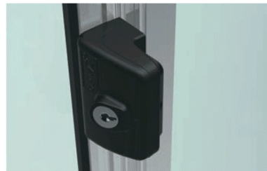
Exclusive proprietary handle for ease of operation with optional colour finishes.

The entire Carinya Collection has been fully tested to meet or exceed Australian Standards AS2047, AS1170, AS1191 and AS3959.